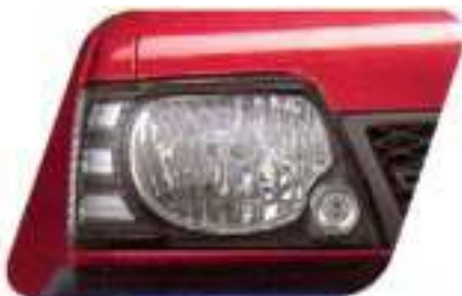
Clear Multi-Reflector Headlights