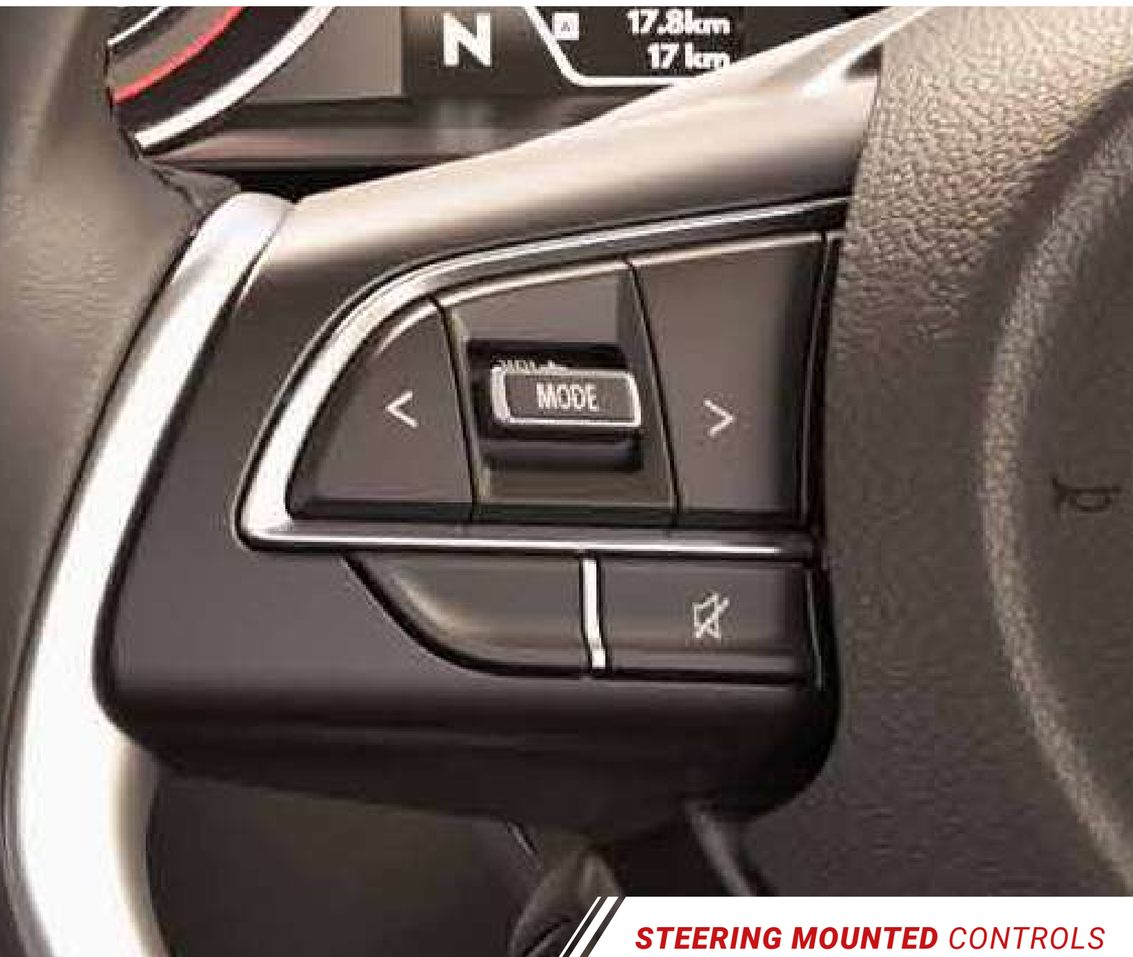
STEERING MOUNTED CONTROLS