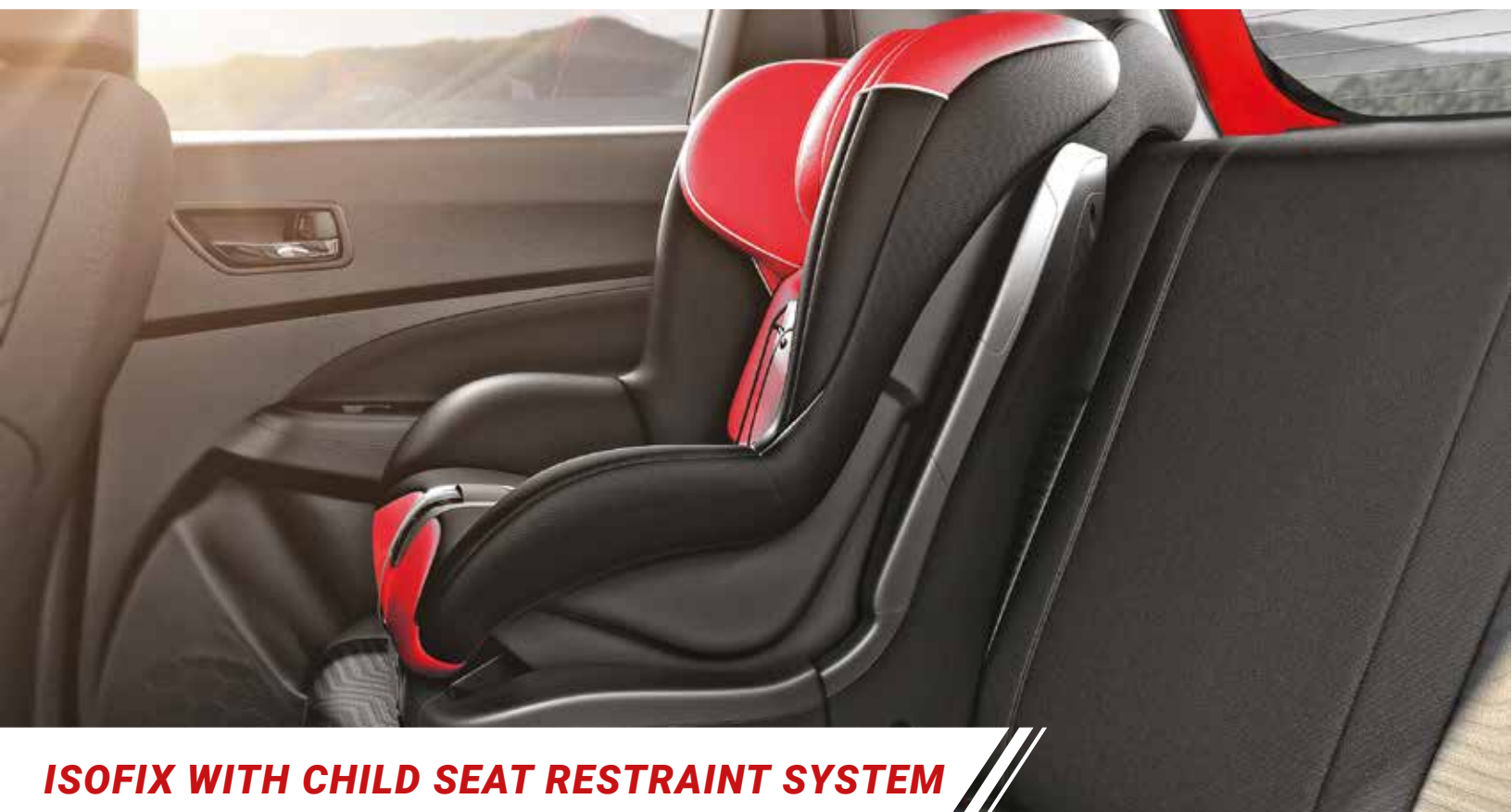
ISOFIX WITH CHILD SEAT RESTRAINT SYSTEM