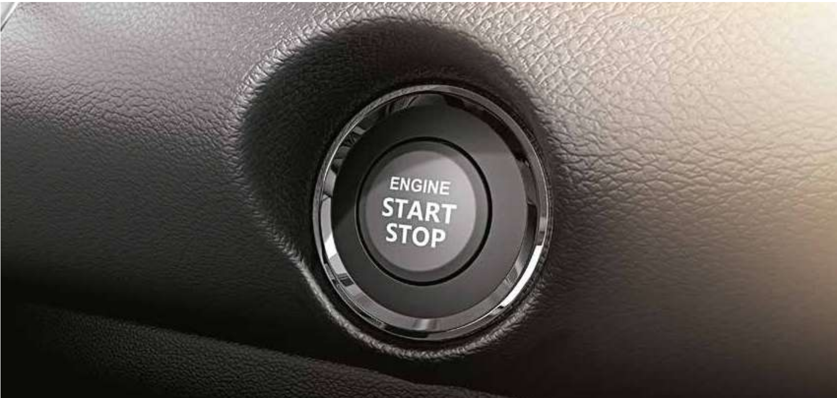
PUSH START-STOP BUTTON