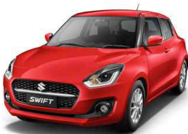
SOLID FIRE RED