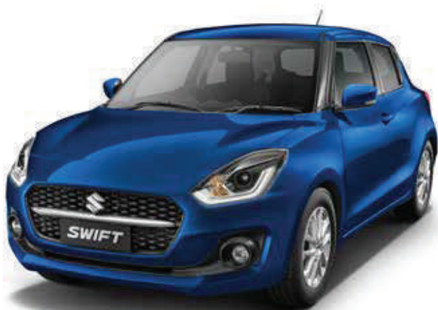
PEARL METALLIC MIDNIGHT BLUE