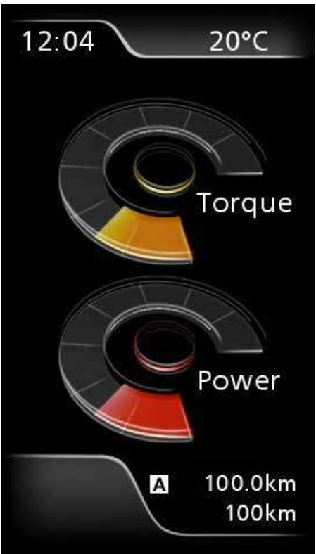
POWER & TORQUE