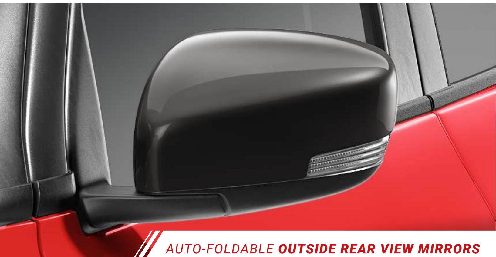
AUTO-FOLDABLE OUTSIDE REAR VIEW MIRRORS