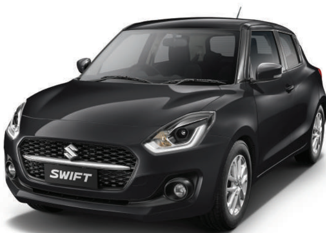
PEARL MIDNIGHT BLACK