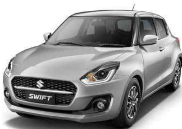
METALLIC SILKY SILVER