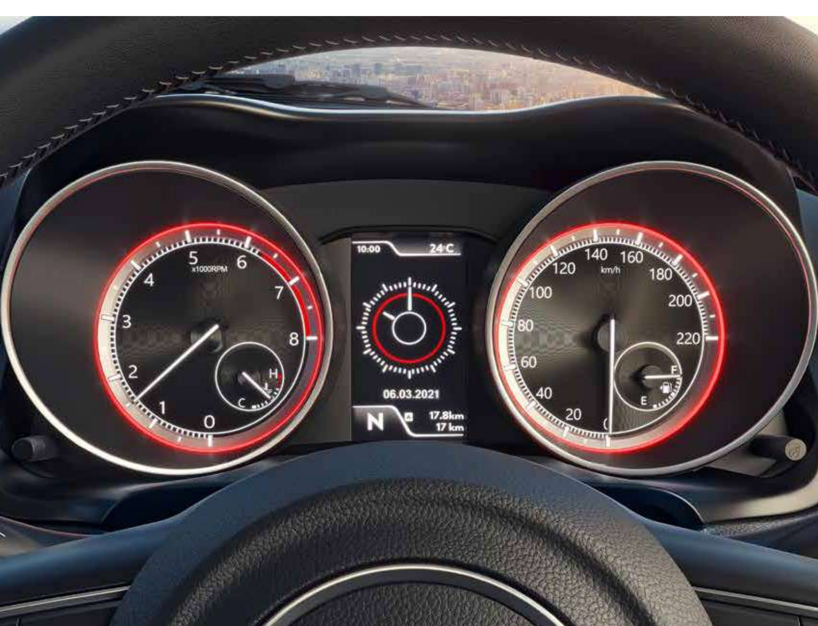
COLOURED MULTI-INFORMATION DISPLAY