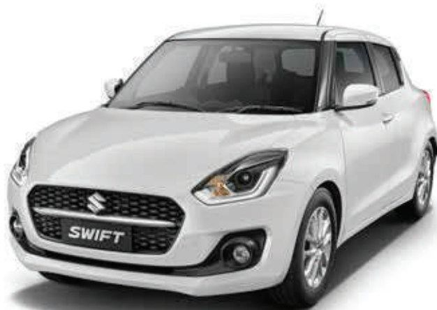
PEARL ARCTIC WHITE