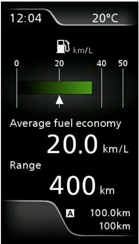
AVERAGE FUEL ECONOMY