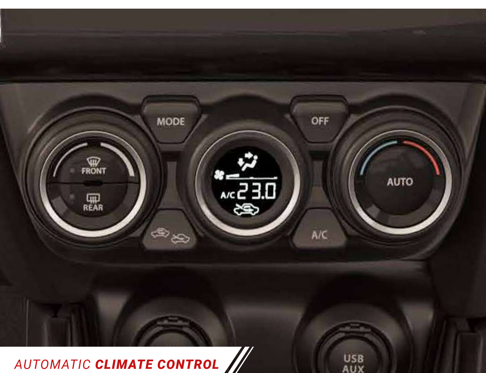
AUTOMATIC CLIMATE CONTROL