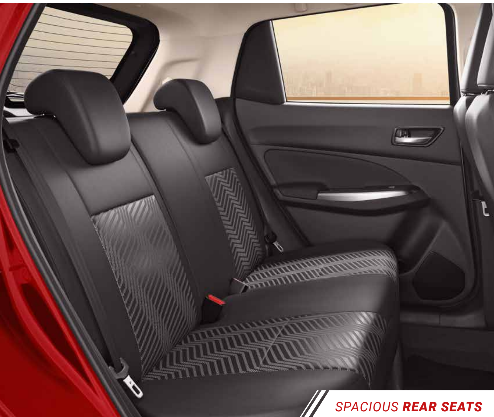
SPACIOUS REAR SEATS