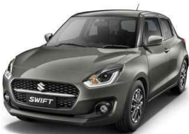
METALLIC MAGMA GREY