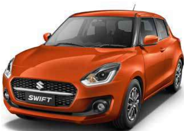
PEARL METALLIC LUCENT ORANGE